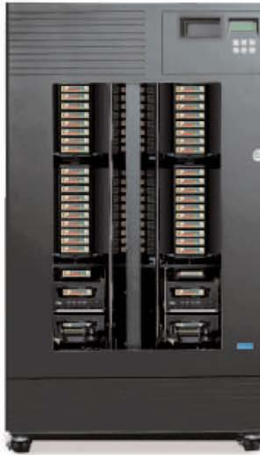
Qualstar 132 TB SAIT Tape Library

DALI has the ability to store and back up hundreds of thousands of maps for business continuity. With the exception of the UK the DGC is responsible for mapping all the earth's surface above sea level.